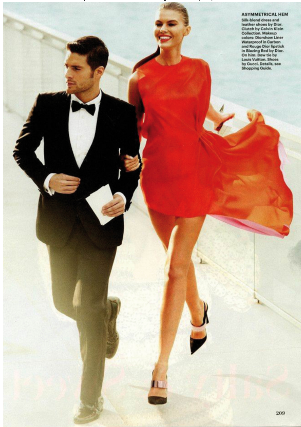
ASYMMETRICAL HEM Silk-blend dress and leather shoes by Dior. Clutch by Calvin Klein Collection. Makeup colors: Diorshow Liner Waterproof in Carbon and Rouge Dior lipstick in Blazing Red by Dior. On him: Bow tie by Louis Vuitton. Shoes by Gucci. Details, see Shopping Guide.