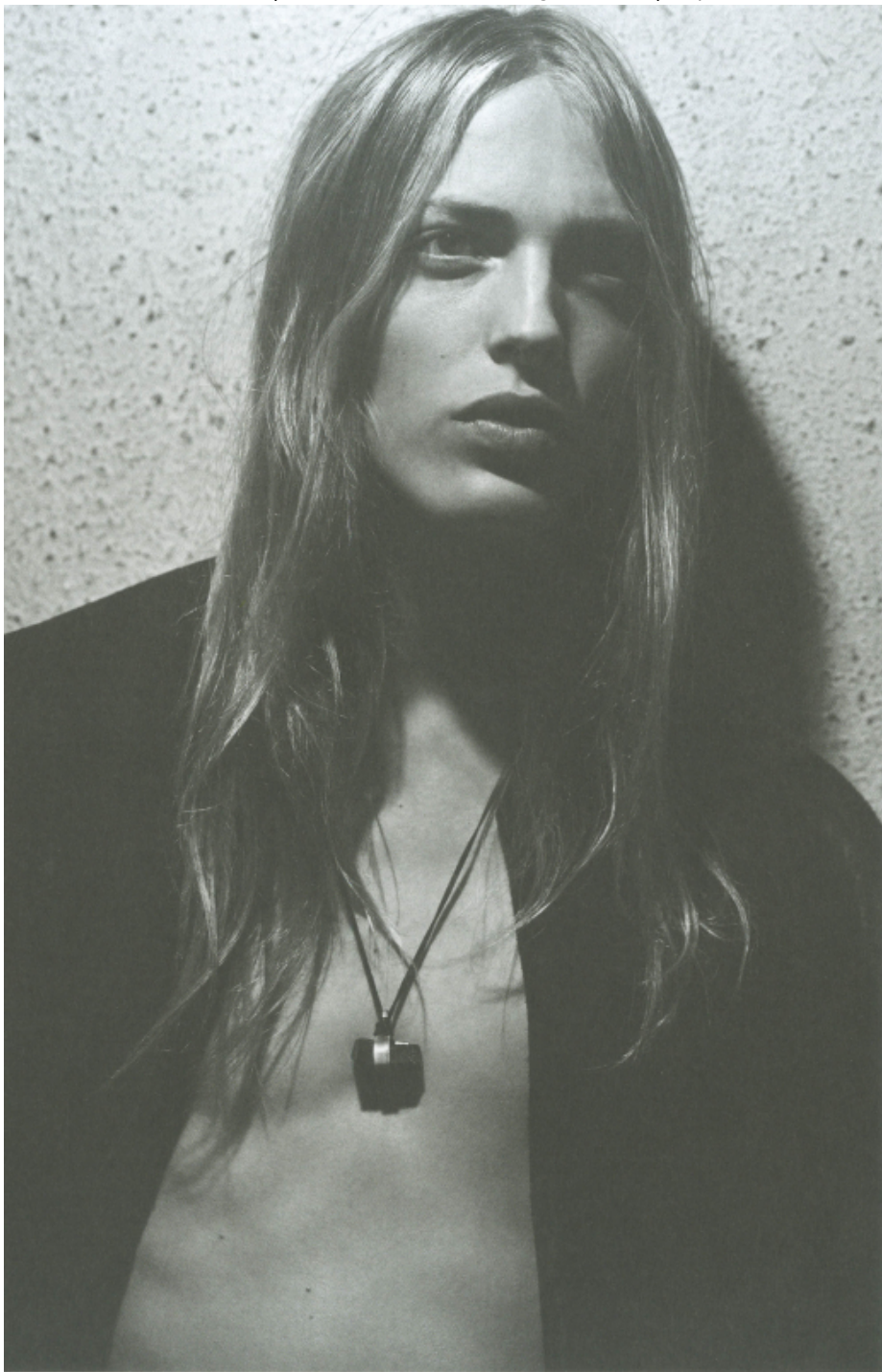
Black wool jersey coat by EMPORIO ARMANI. Black tourmaline and sterling silver necklace by RENÉ TALMON L'ARMÉE.