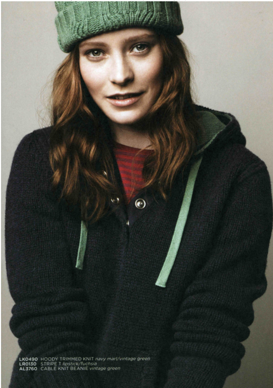
LK0490 HOODY TRIMMED KNIT navy marl/vintage green LR0130 STRIPE T lipstick/fuchsia AL3760 CABLE KNIT BEANIE vintage green