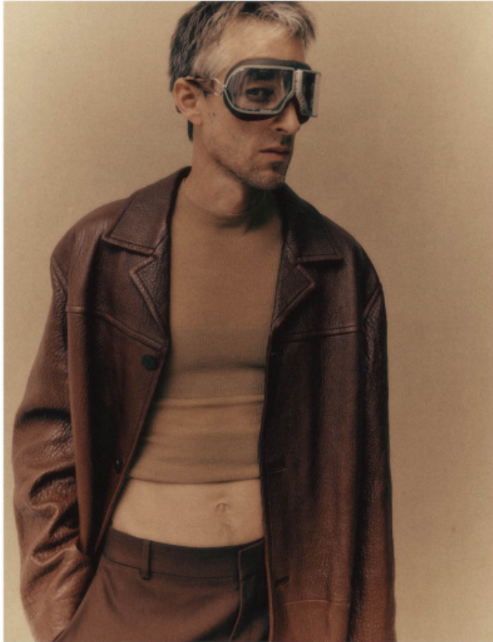
TOTAL LOOK, VERSACE.