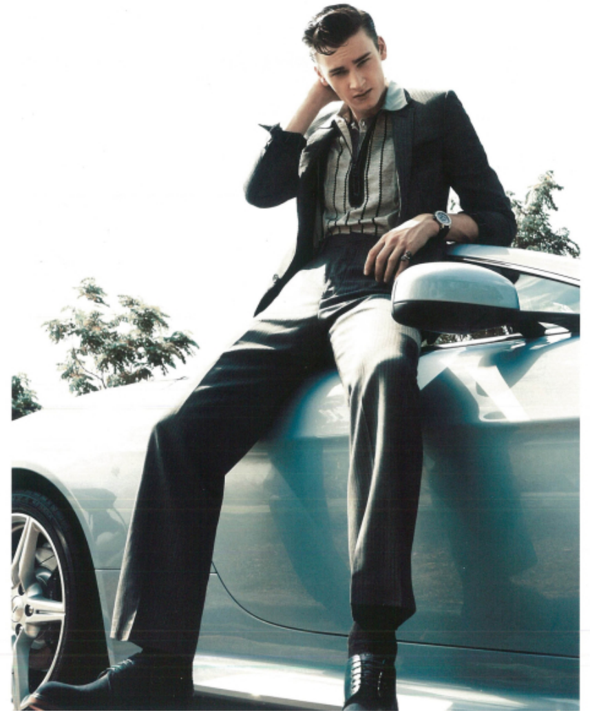
ANVIN 羊绒外套 人造棉上衣 羊绒长裤 TEGA VENETA 喀什米尔绒上衣 M&S 皮革系带鞋 CI 金属戒指 造型师提供 IARD MILLE RM033 红金表壳腕表