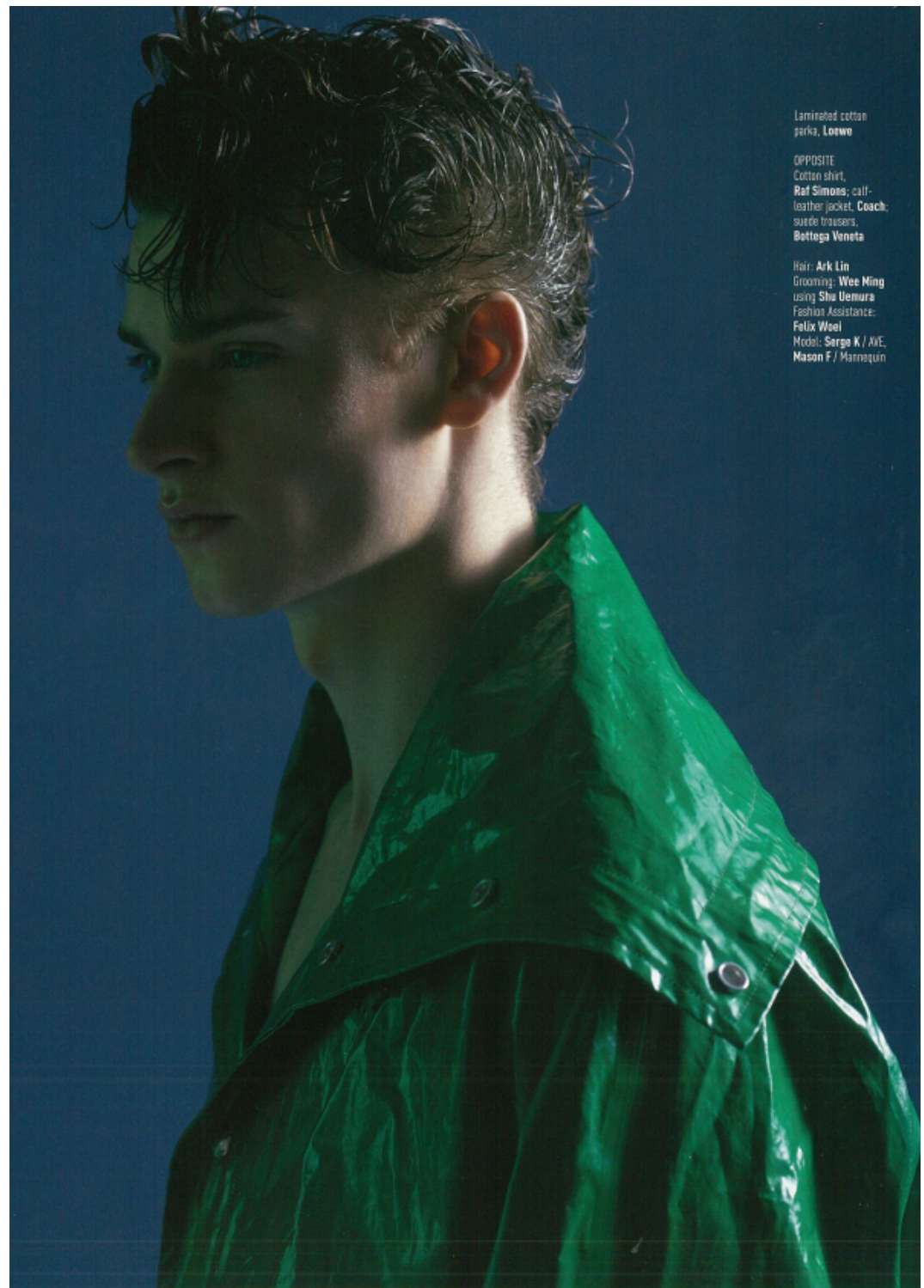
Laminated cotton parka, Loewe