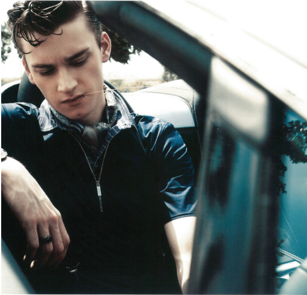
CALVIN KLEIN PLATINUM 混棉上衣 BRUNELLO CUCINELLI 棉质 POLO 衫 ERMEGILDO ZEGNA COUTURE 丝质印花围巾 GUCCI 金属戒指 RICHARD MILLE RM033 红金表壳腕表