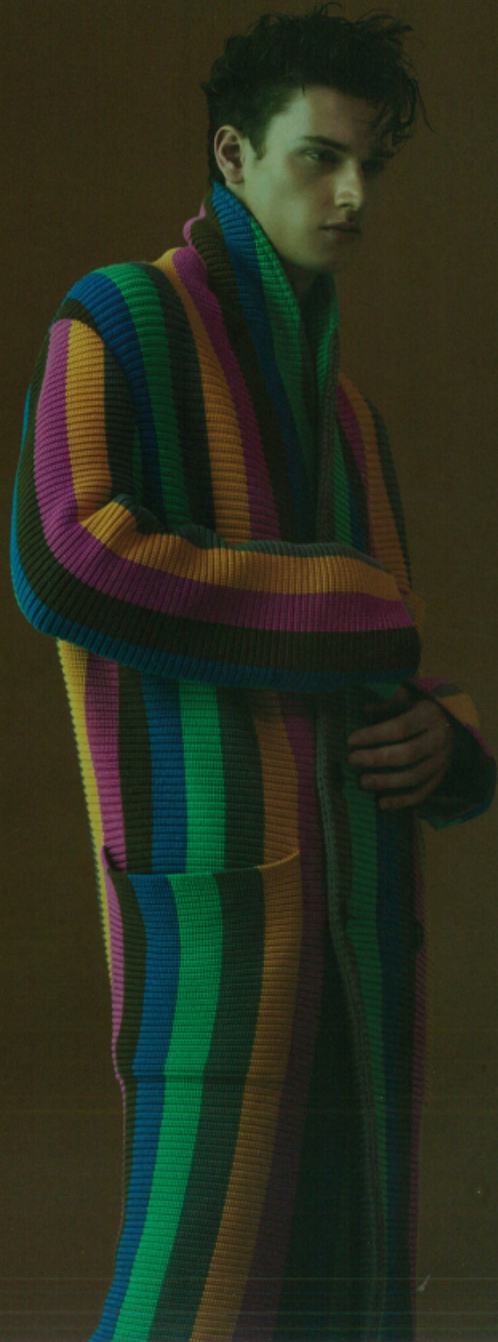
Cotton-blend oversized cardigan, Loewe