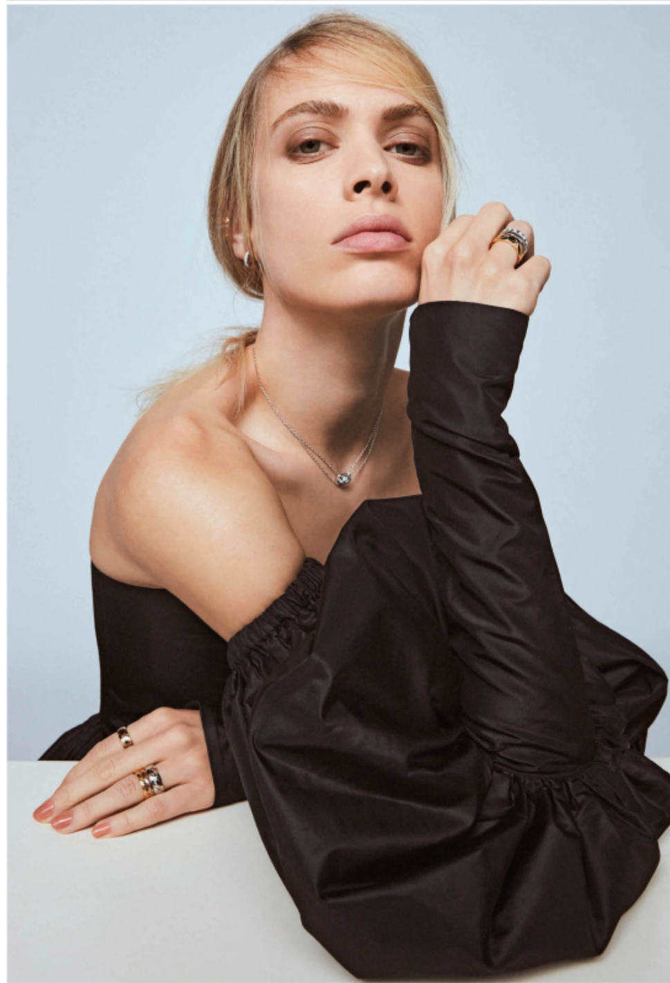
Anelli, collana e orecchini "Coco Crush", motivo matelassé in oro con diamanti SPANIEL JEWELLERY. Abito in taffetà nero con maniche a sbuffo Chanel.