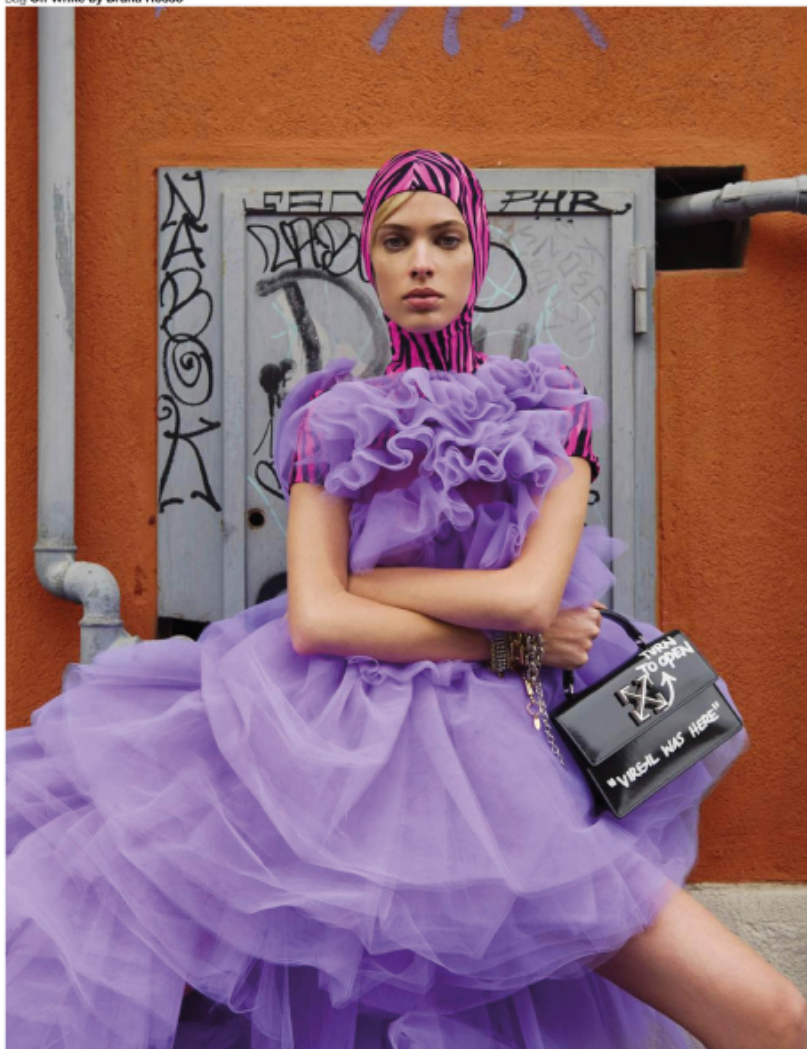
Top Annakiki Dress Belfiore Couture Bracelets Rada' Bag Off White by Bruna Rosso