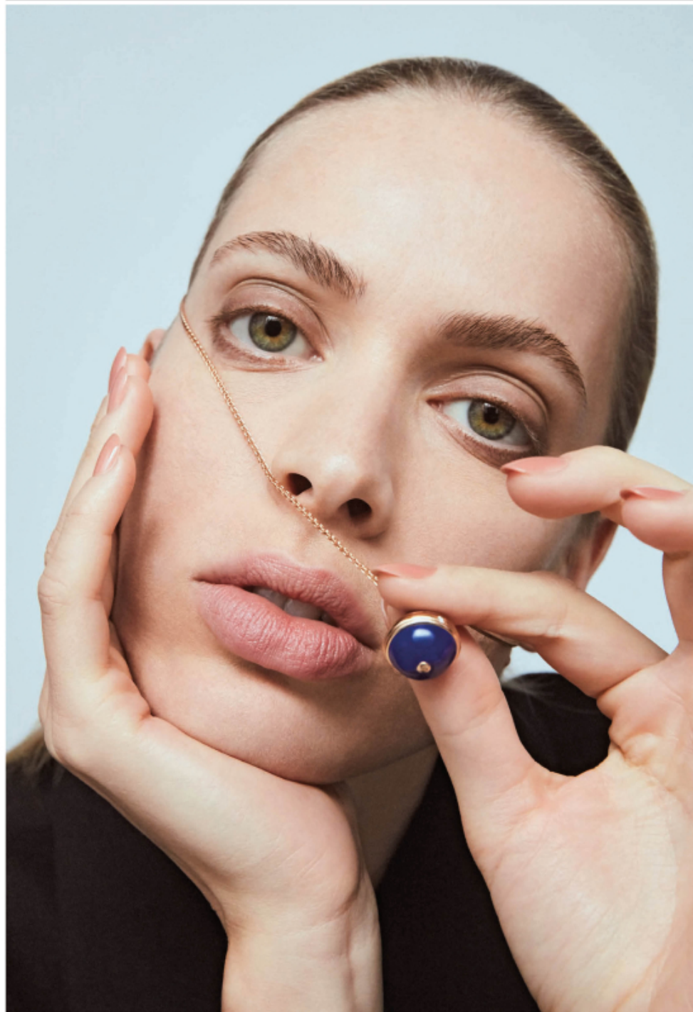
Collana "Possessioni" in oro rosa con diamante e lapislazzuli PIRELLA. Giacca in cashmere Saint Laurent by Anthony Vaccarello.