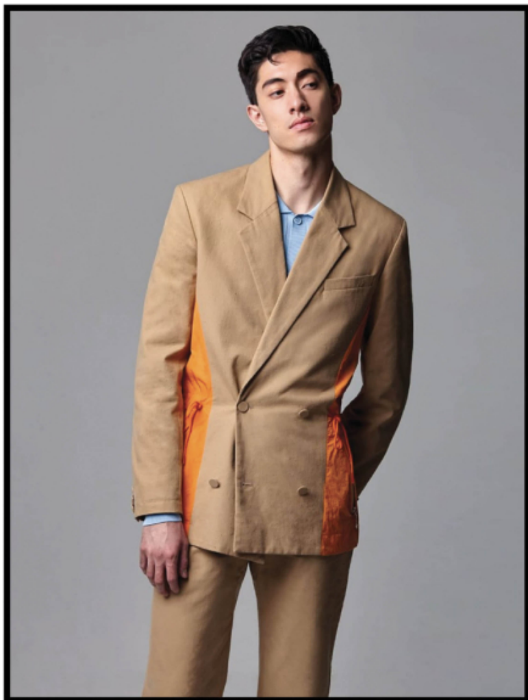
Viscose-blend polo T-shirt, polyester-blend jacket, polyester-blend trousers, paa, all Kenzo