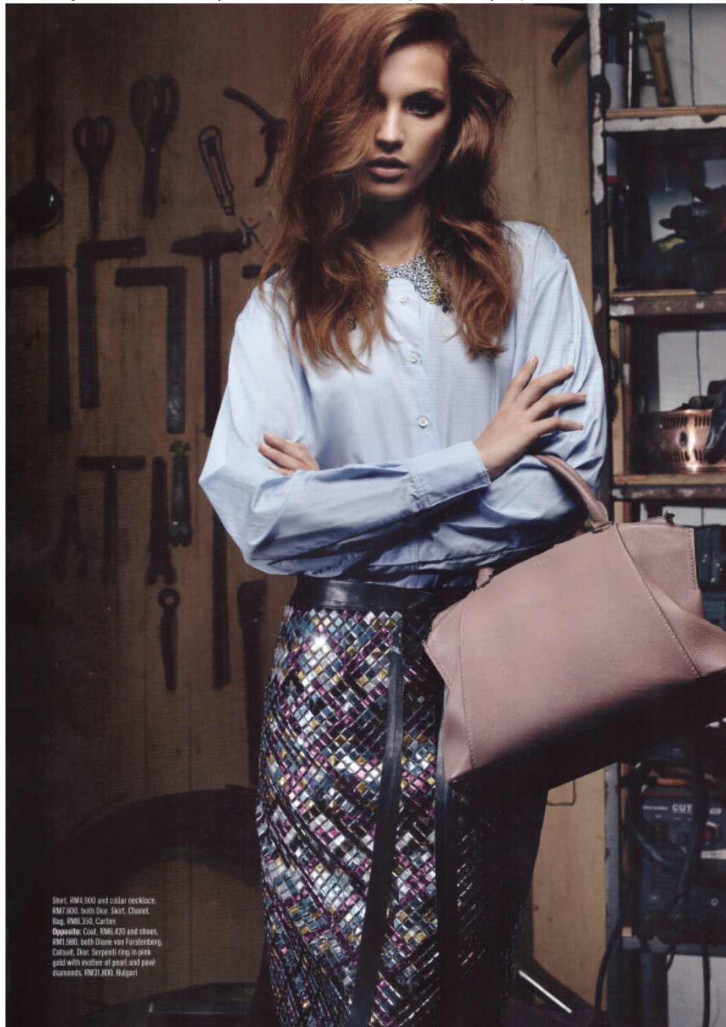
Shirt, RM4.500 and collar necklace, RM7.800, both Dior, Skirt, Chanel, Bag, RM8.350, Carter Opposite: Coat, RM9.420 and shoes, RM1.580, both Diane von Furstenberg, Catsuit, Dior, Serpenti ring in pink gold with mother of pearl and pave diamonds, RM31.800, Bulgari