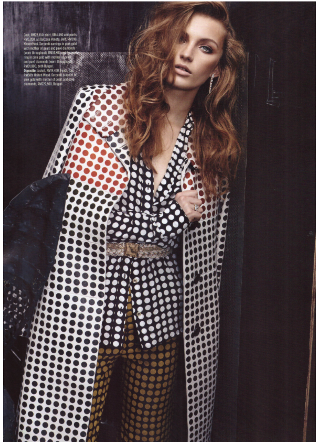
Coat, RM22.850, shirt, RM4.490 and pants, RM5.020, all Bottega Veneta, Belt, RM395, KhouriHoe, Serpenti earrings in pink gold with mother of pearl and pave diamonds (worn throughout), RM31.800, Serpenti ring in pink gold with mother of pearl and pave diamonds (worn throughout), RM21.800, both Bulgari Opposite: Jacket, RM14.450, Pink, Top, RM188, United Wood, Serpenti bracelet in pink gold with mother of pearl and pave diamonds, RM222.800, Bulgari