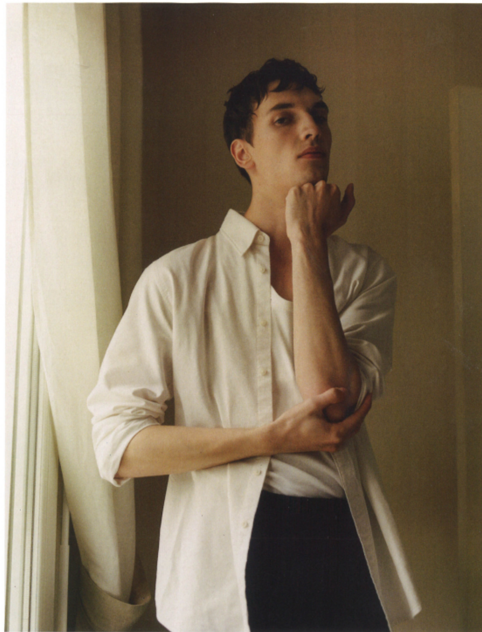
CHEMISE UNIQLO 29,90 € DEBARDEUR POLO RALPH LAUREN 29,95 € PANTALON LOUIS VUITTON 650 €