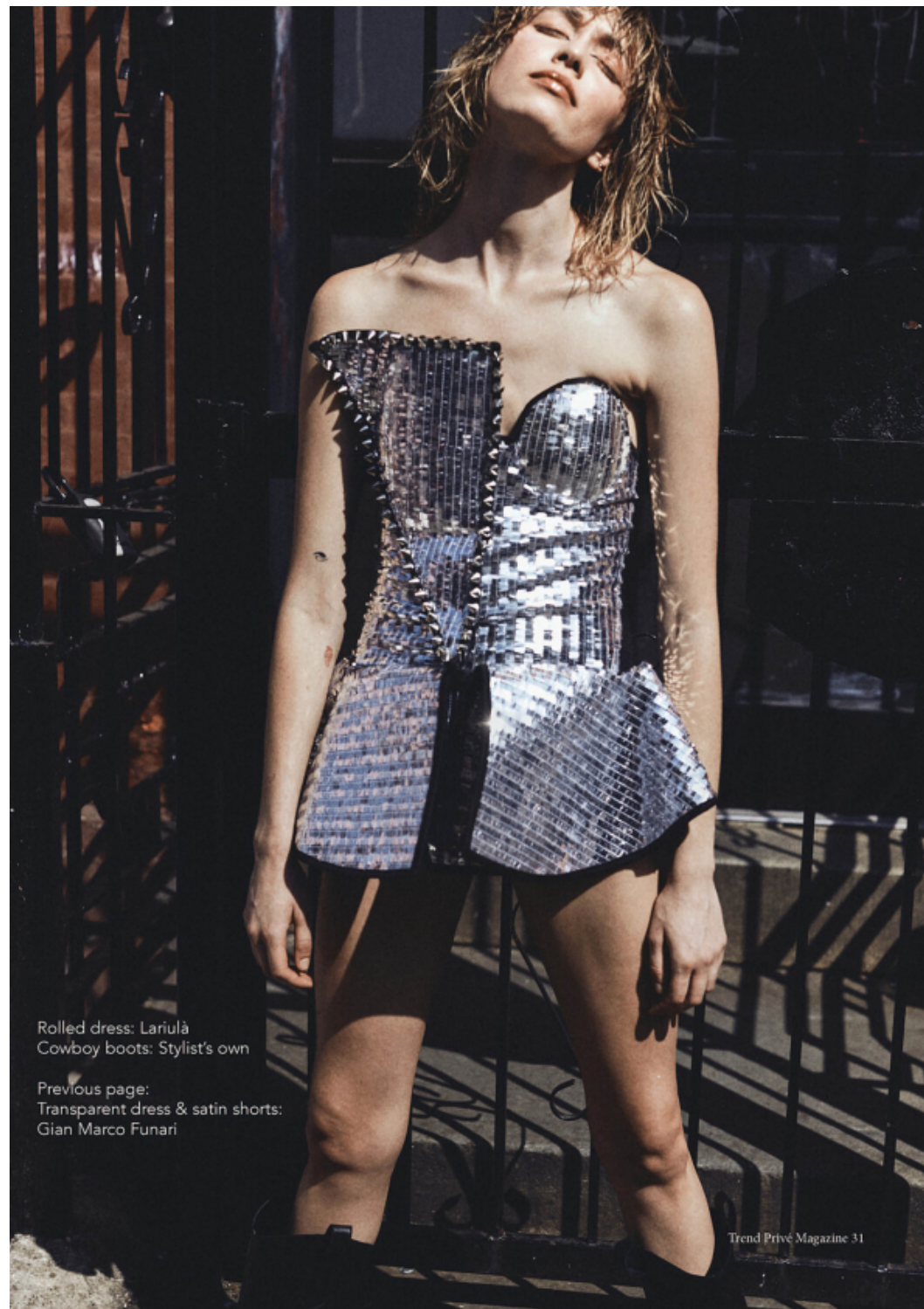
Rolled dress: Lariulà Cowboy boots: Stylist's own