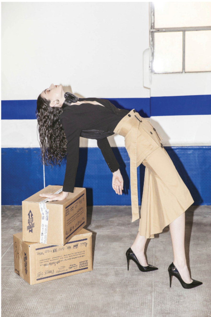
belt: Nido, blazer & skirt: Judy Zhang, ring & earrings: Co.Ro Jewels, shoes: stylist's own