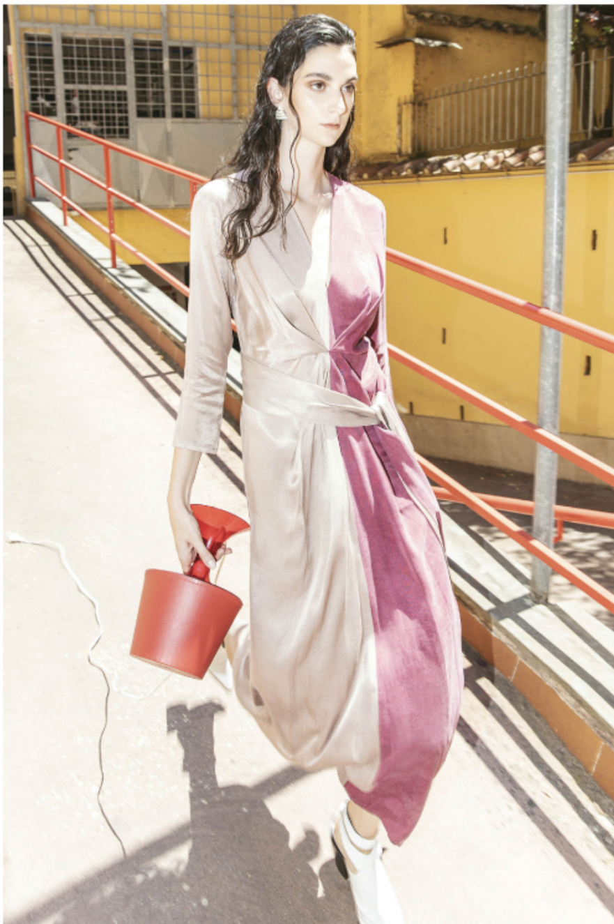
dress: PNL, shoes: Topshop, earrings: Co.Ro Jewels