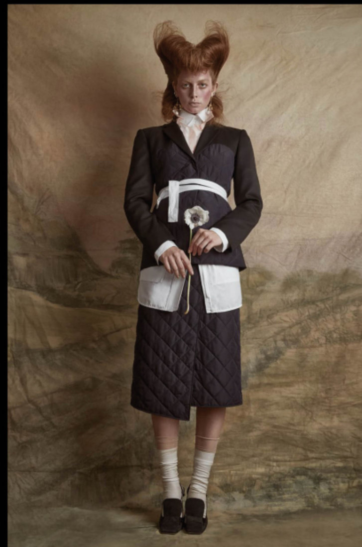
Puffer jacket and skirt, COLIAC . Cotton shirt and belt, SPORTMAX . Sheer shirt, MAJE . Earrings, TORY BURCH . Suede pumps, FENDI .