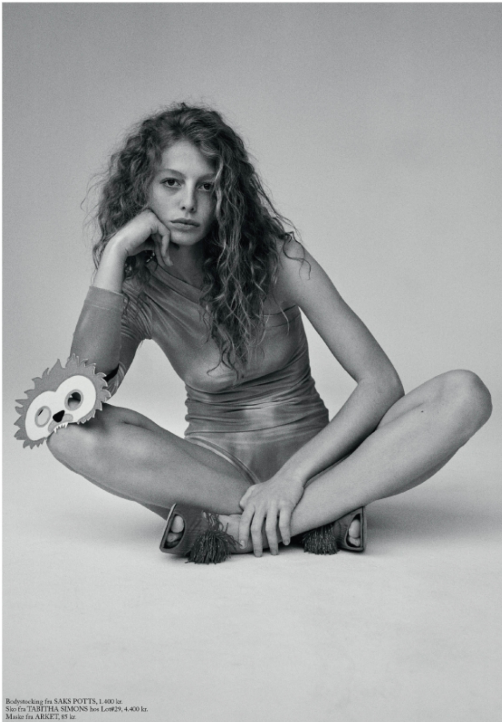
Bodystocking fra SAKS POTTS, 1.400 kr. Sko fra TABITHA SIMONS hos Loo#29, 4.400 kr. Maske fra ARKET, 85 kr.