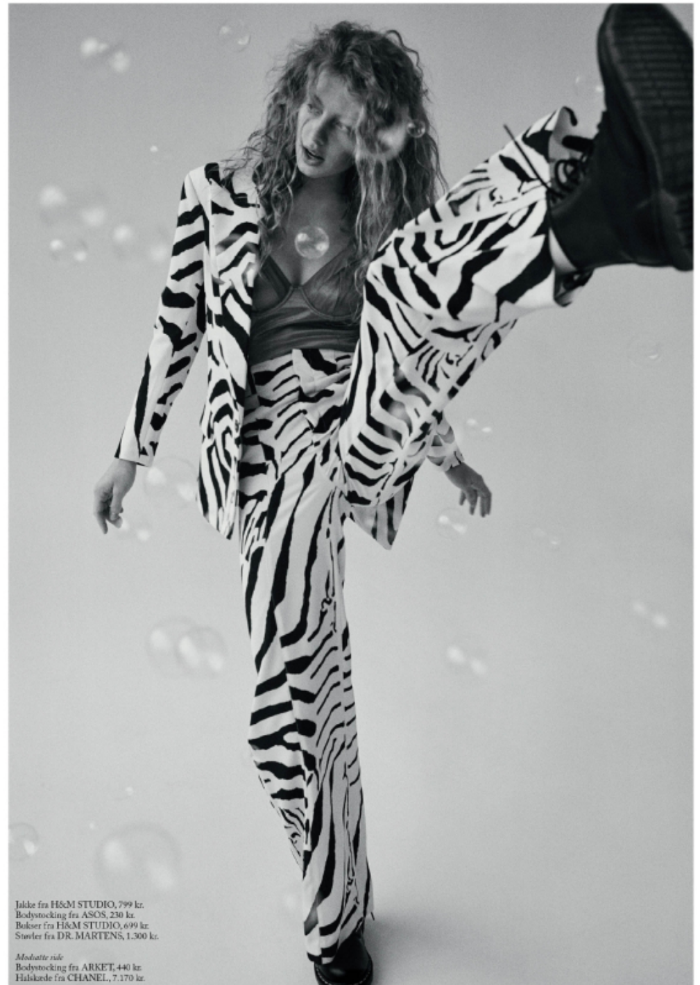
Jakke fra H&M STUDIO, 799 kr. Bodystocking fra ASOS, 230 kr. Bukser fra H&M STUDIO, 699 kr. Støvler fra DR. MARTENS, 1.300 kr.