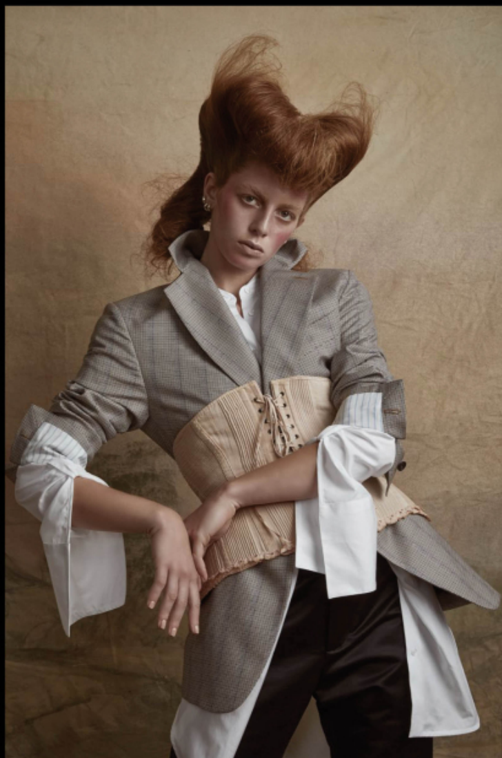
Jacket and satin pants, VIVIENNE WESTWOOD . Shirt, DONDUP . Corset, MADAME PAULINE VINTAGE .