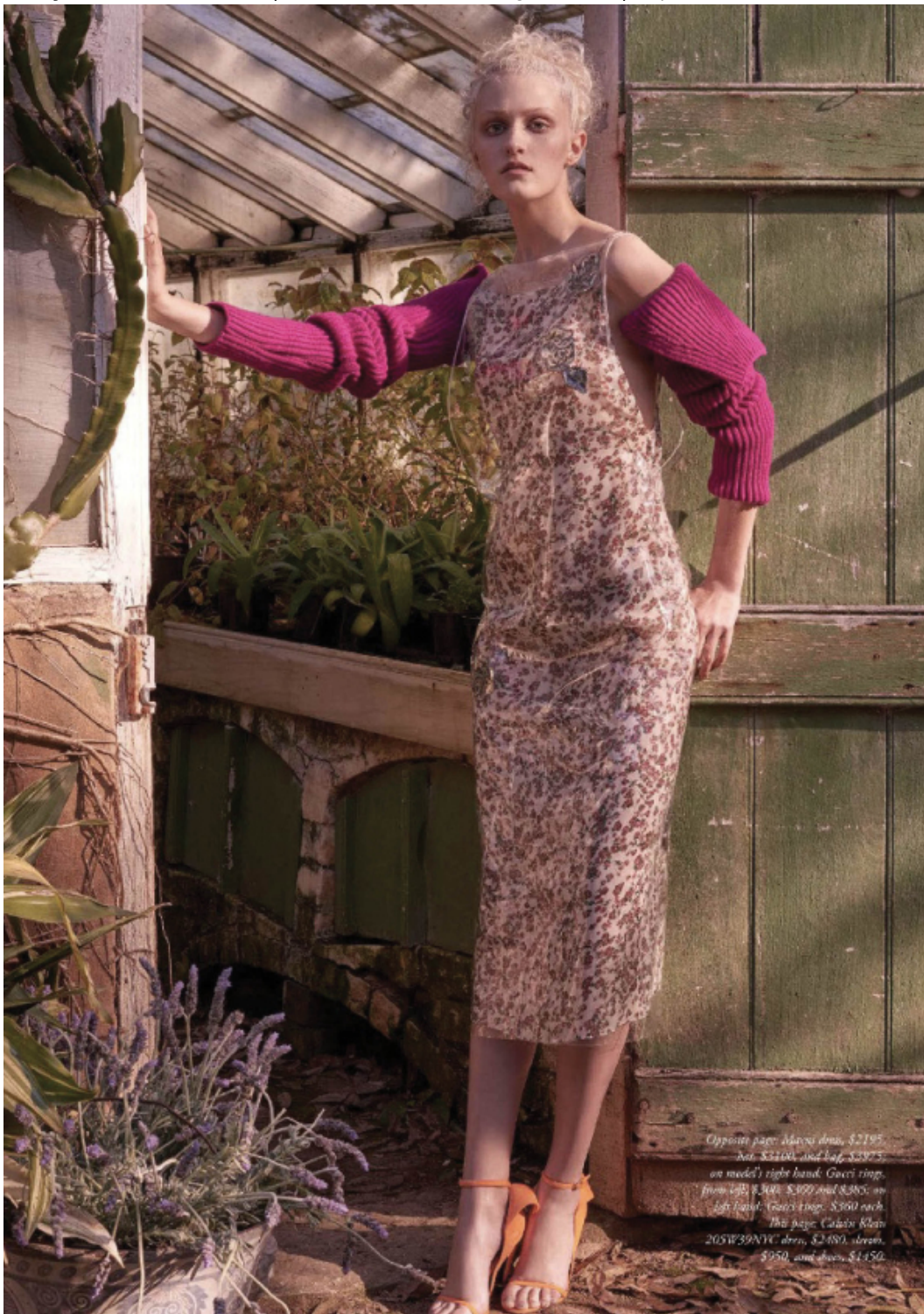
Opposite page: Abaya dress, $2195, hat, $3200, and bag, $3975; on model's right hand: Gucci ring, from 1930, $300, and $285; on left hand: Gucci ring, $360 each. This page: Calvin Klein 205W39A11C dress, $2480, sleeves, $950, and shoes, $1450.