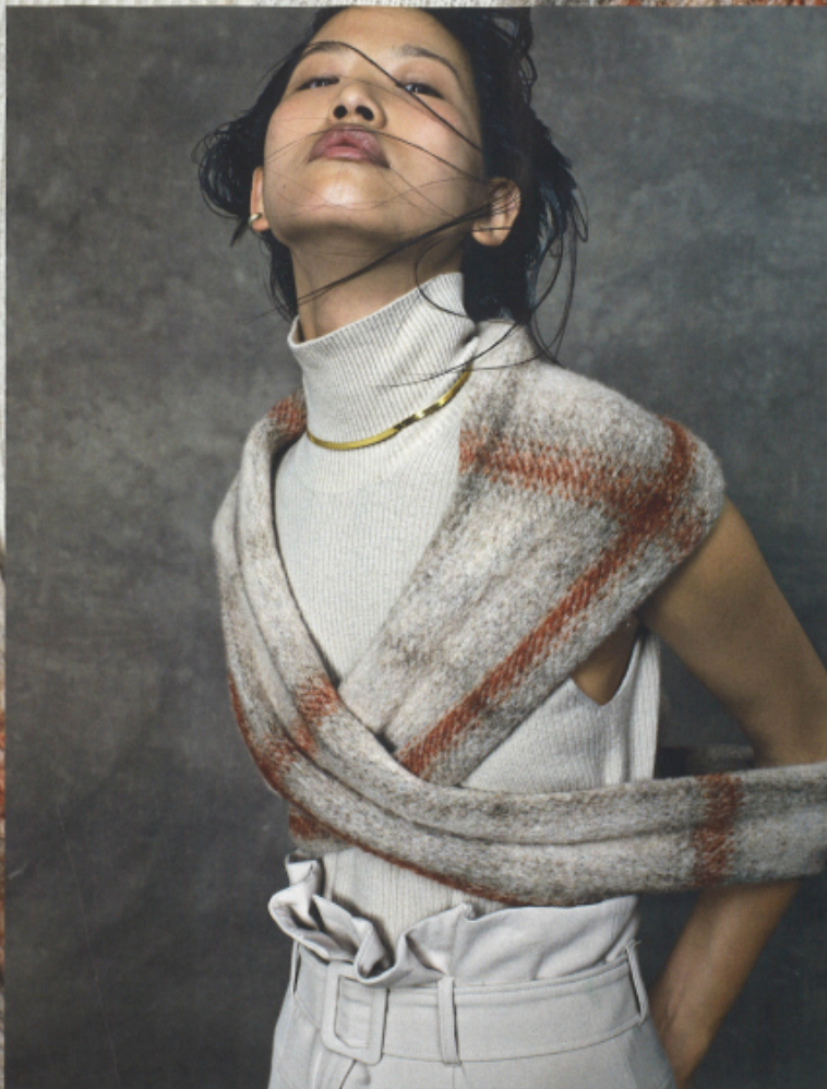
Top dolcevita in maglia a costine, sciarpa di lana e pantaloni a vita alta. MAX&CO. Collier. LIL MILAN. Pagina accanto: girocollo in cashmere. LES COPAINS. Pantaloni in tessuto moiré. LUISA SPAGNOLI.