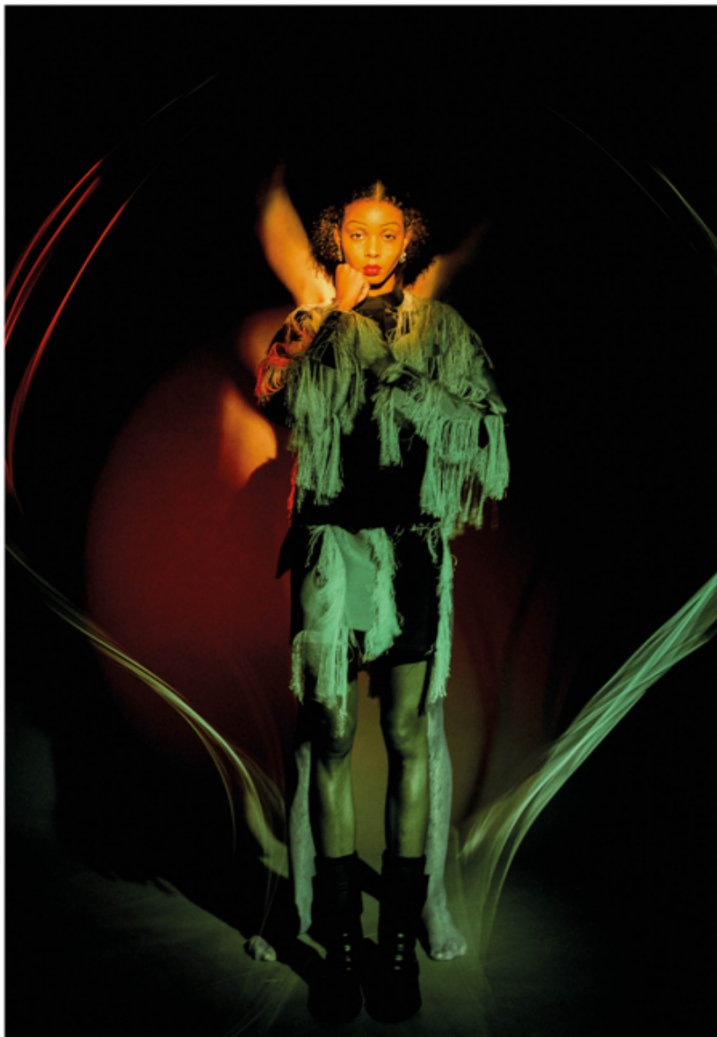
Total look: Salvatore Ferragamo | Earrings: Garçon de Famille