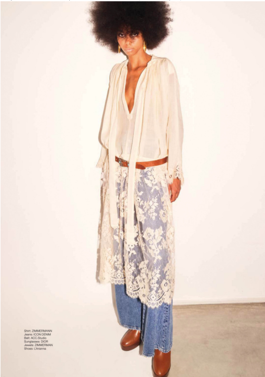
Shirt: ZIMMERMANN Jeans: ICON DENIM Belt: ACC Studio Sunglasses: DIOR Jewels: ZIMMERMANN Shoes: L'Arianna