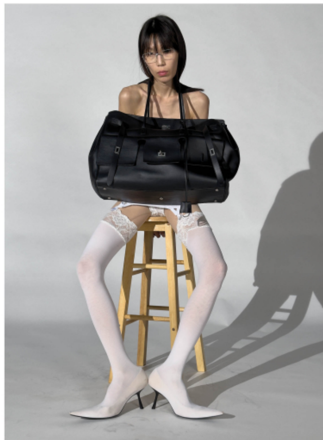
balenciaga by juergen teller