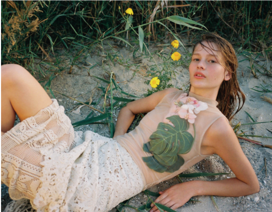
Топ из тюля с аппликацией, Y/Project; кружевная юбка, Balenciaga