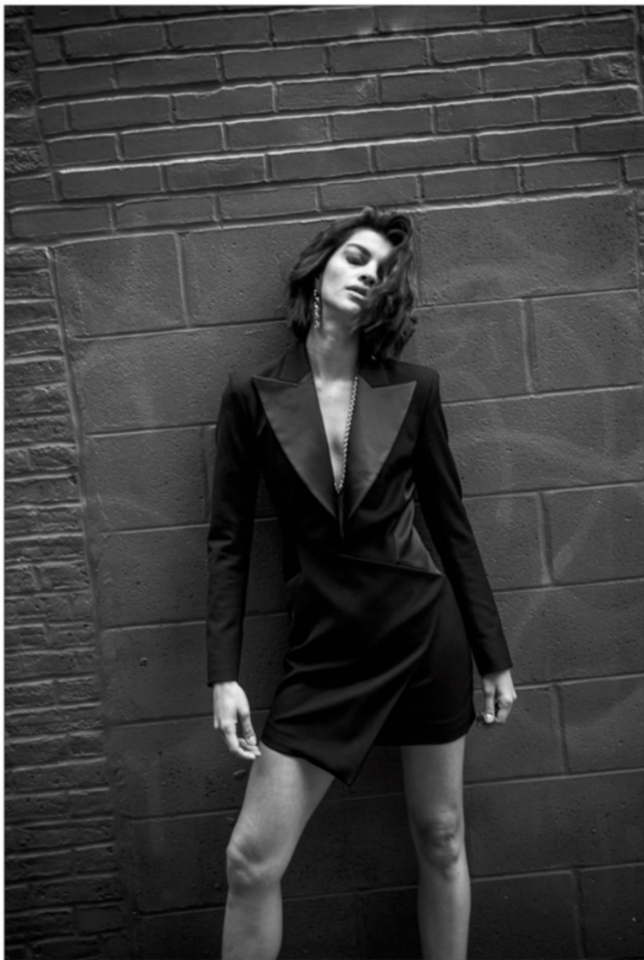
Make & Hair (Smoking dress and chain jewelry by Gucci, Pierced hair hole by Versace)