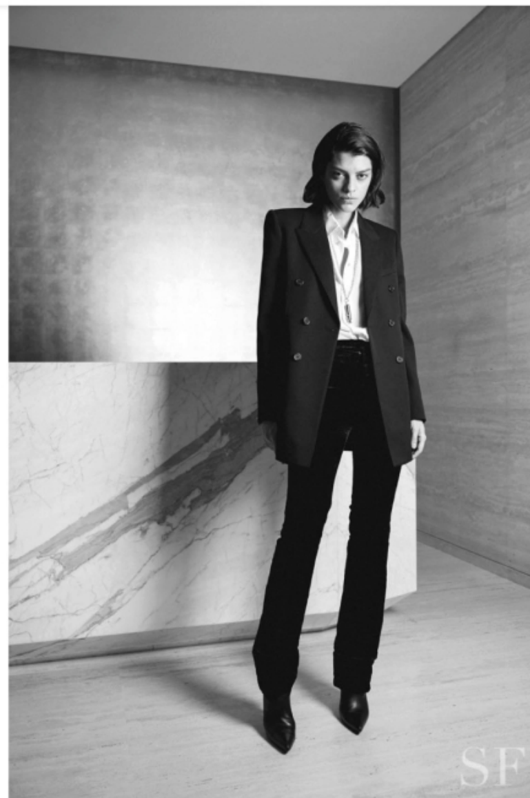
Saint Laurent by Anthony Vaccarello Spring 2022