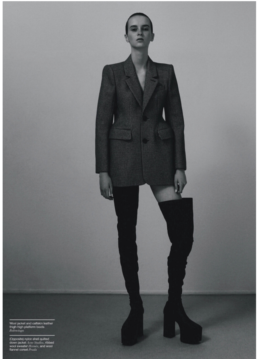
Wool jacket and calfskin leather high-high platform boots Balenciaga