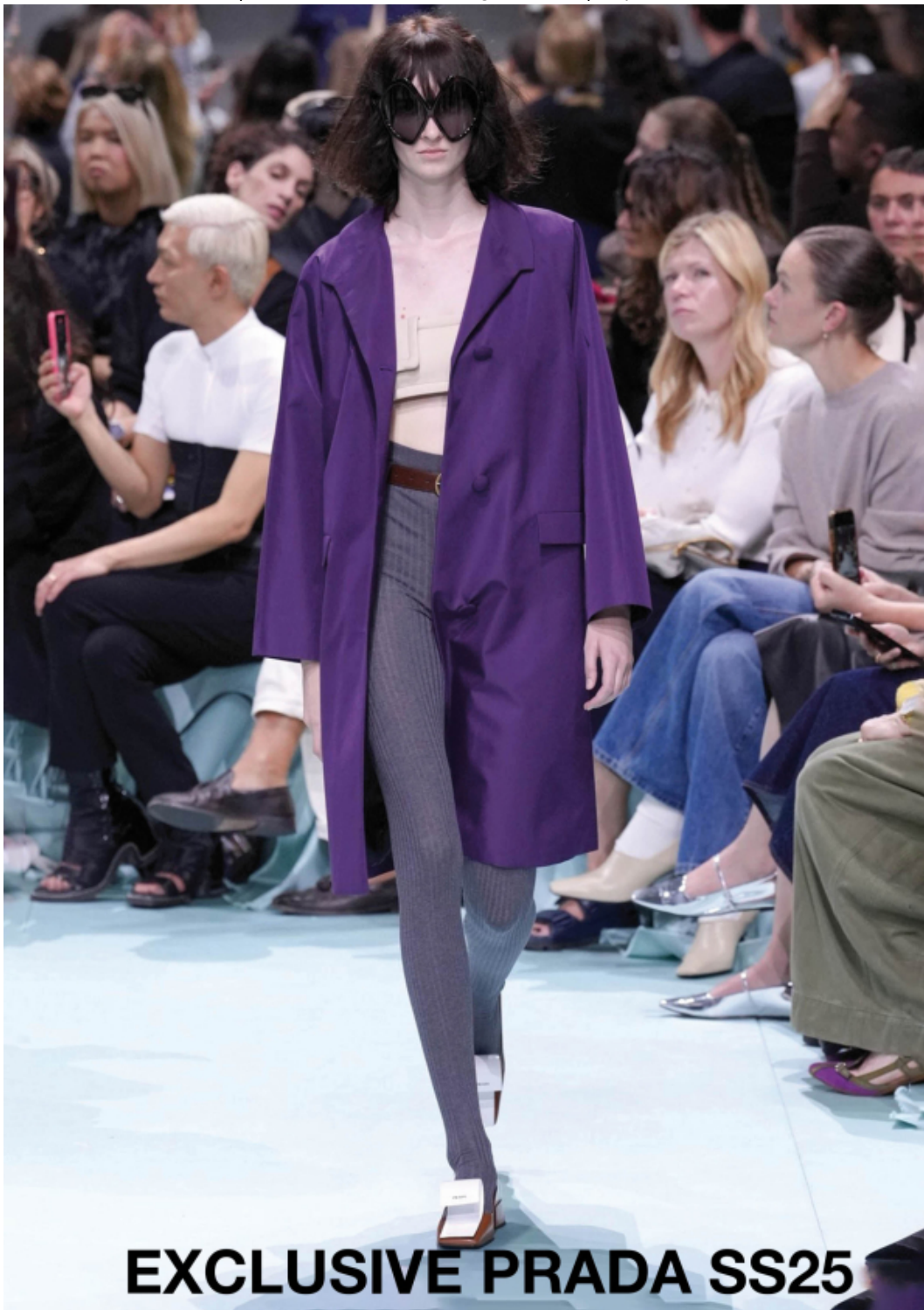
EXCLUSIVE PRADA SS25