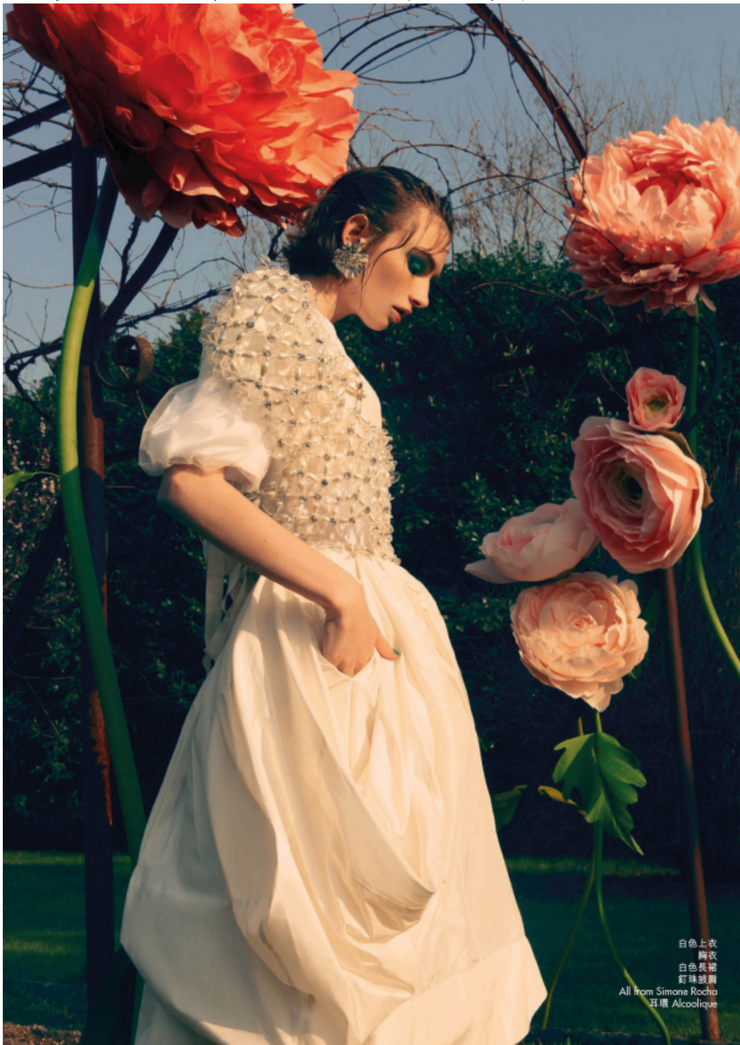
白色上衣 胸衣 白色長裙 釘珠裝飾 All from Simone Rocha 耳環 Alcoolique