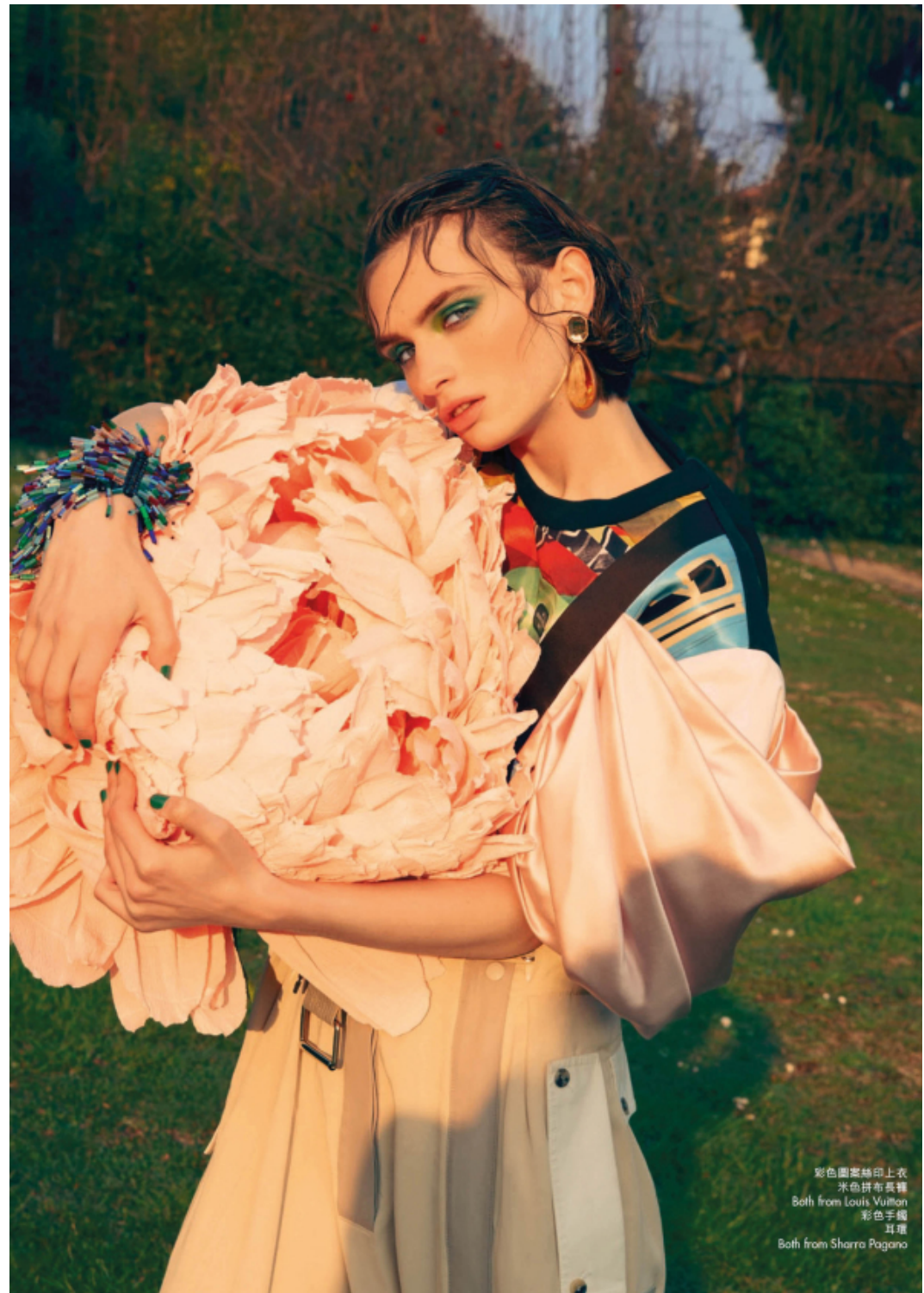
彩色圖案絲印上衣 米色拼布長褲 Both from Louis Vuitton 彩色手鐲 耳環 Both from Sharra Pagano