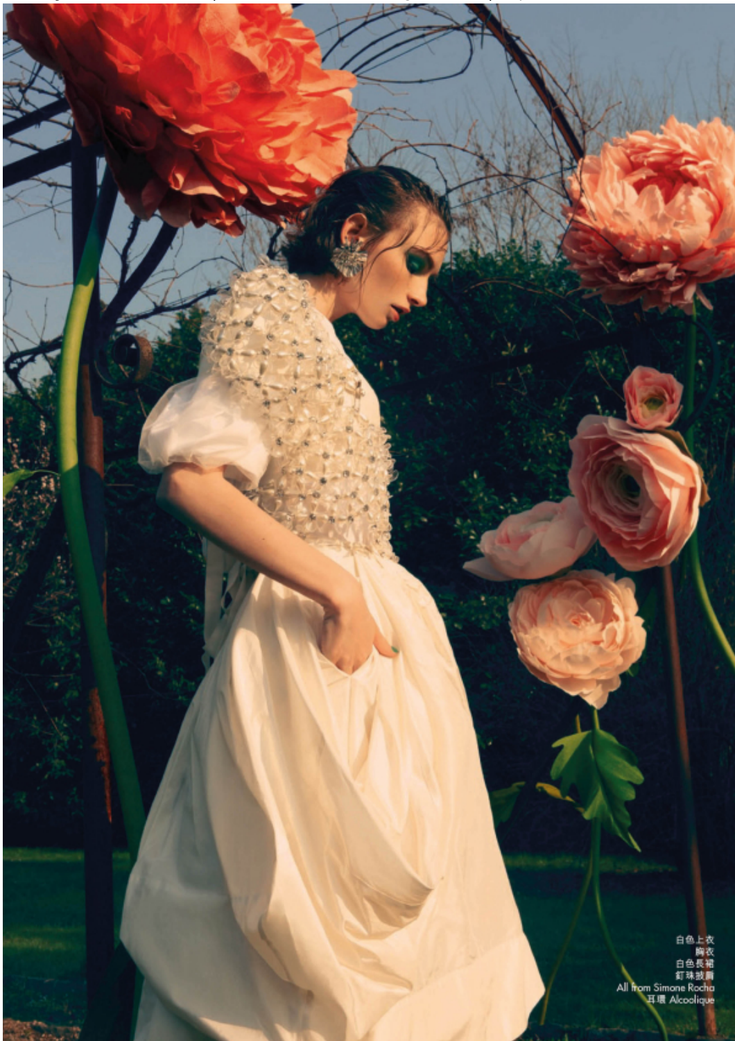
白色上衣 胸衣 白色長裙 釘珠裝飾 All from Simone Rocha 耳環 Alcoolique