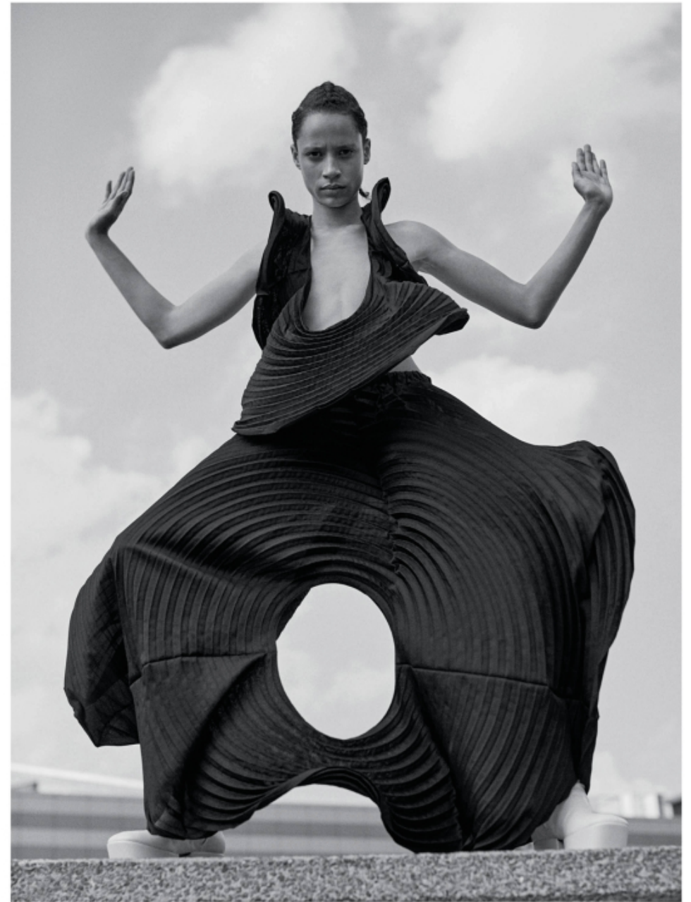
top and skirt by ISSEY MIYAKE, boots by PRADA