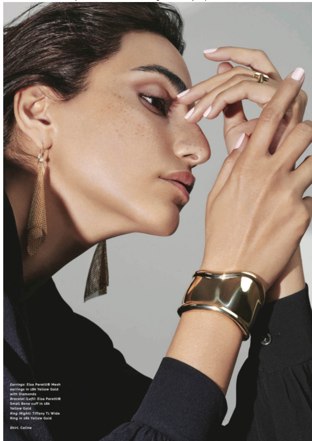
Earrings: Elsa Peretti® Mesh earrings in 18k Yellow Gold with Diamonds Bracelet (Left): Elsa Peretti® Small Bone cuff in 18k Yellow Gold Ring (Right): Tiffany T1 Wide Ring in 18k Yellow Gold