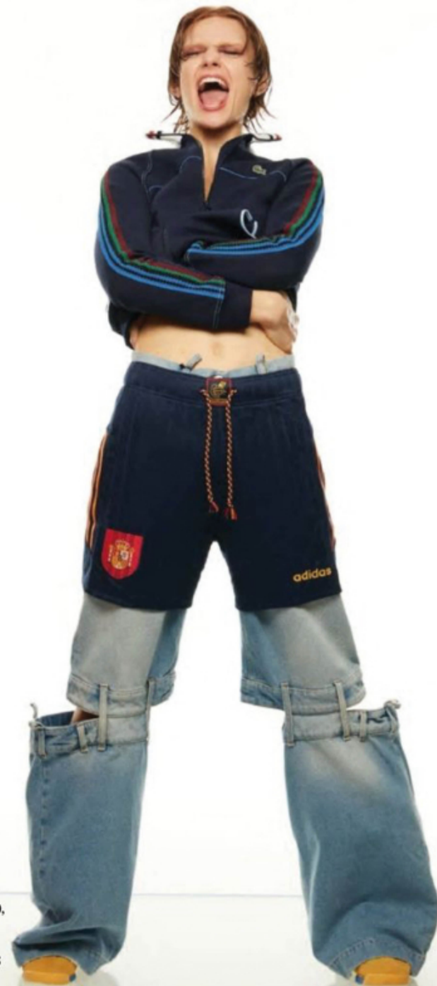
Hırka, LACOSTE Denim pantolon, THE ATTICO, BEYMEN Şort, ADIDAS ORIGINALS Sneaker, ADIDAS ORIGINALS