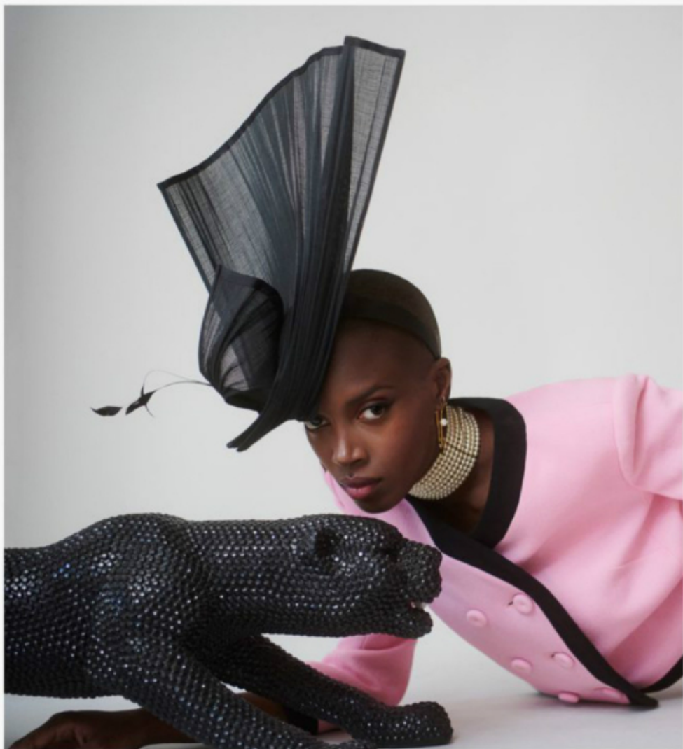
Hat JR MALPERE, earrings AUSTIN JAMES SMITH, choker VINTAGE, blazer MOSCHINO, Opposite: Hat VINTAGE, jacket SKIRT ANGEL CHEN, shoes SCARLET SAGE.