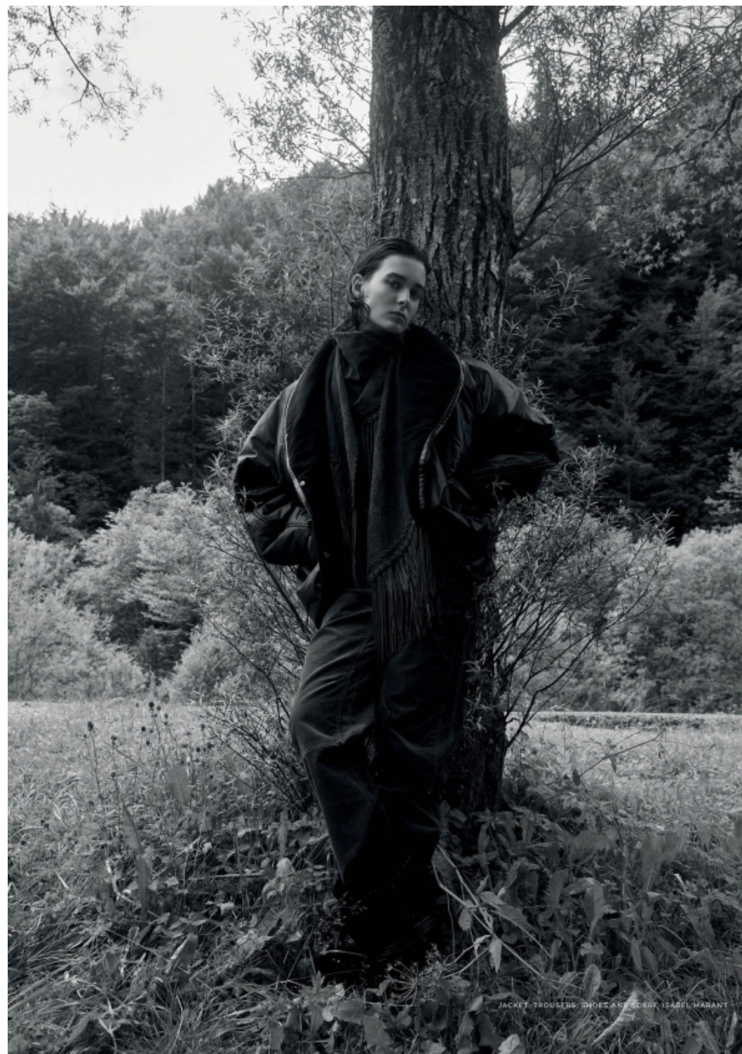
JACKET, TROUSERS, SHOES AND SCARF, ISABEL MARANT