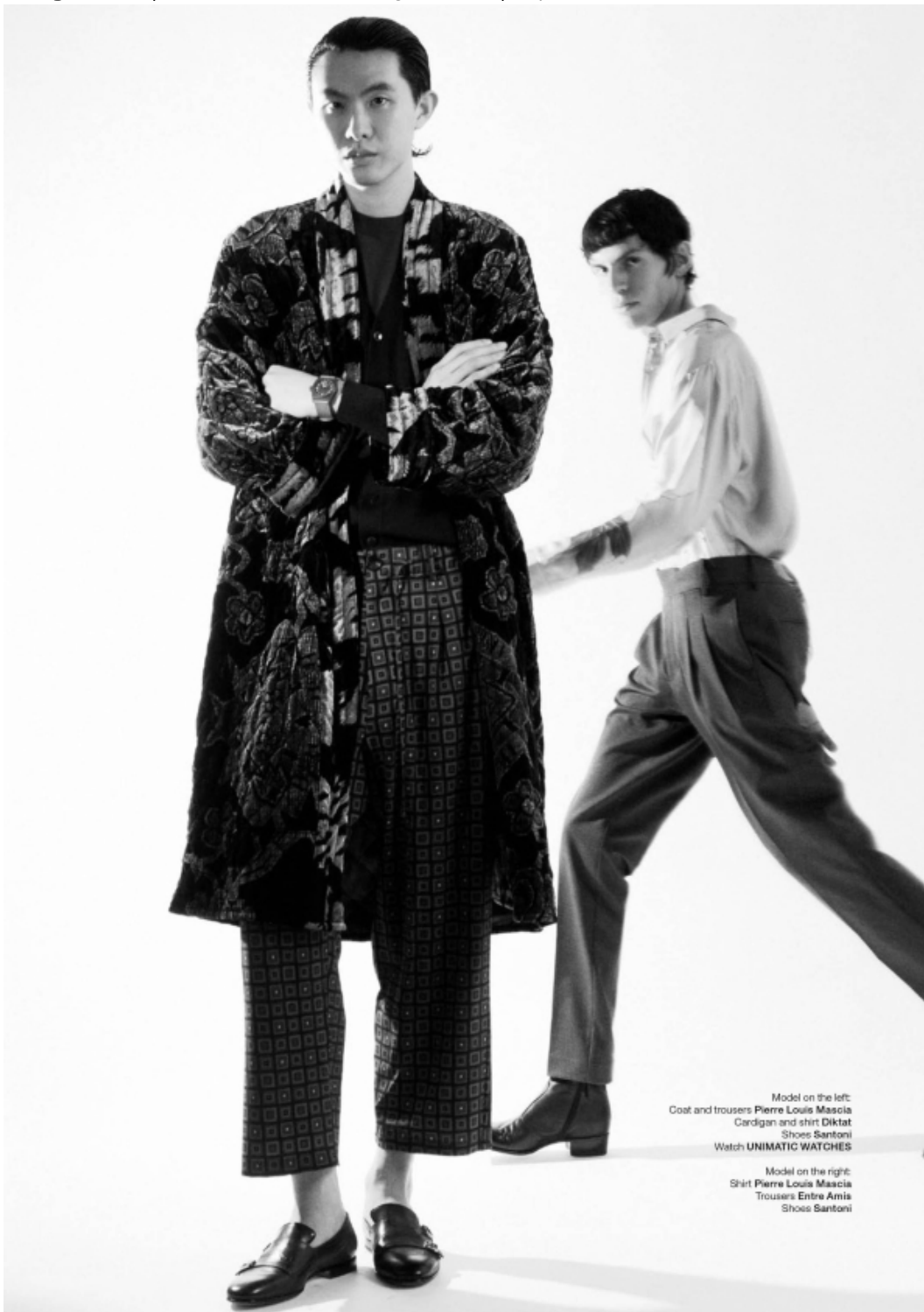
Model on the left: Coat and trousers Pierre Louis Mascia Cardigan and shirt Diktat Shoes Santoni Watch UNIMATIC WATCHES