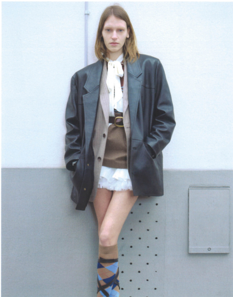
Giacca oversize di pelle, blazer di cashmere, camicia di seta con fiocco, gonna di lana e cintura di pelle vintage, tutto Celine by Hedi Slimane. Gilet di maglia, Charles Jeffrey Loverboy. Gonna di tulle, Stefan Cooke. Calze, stylist's own.