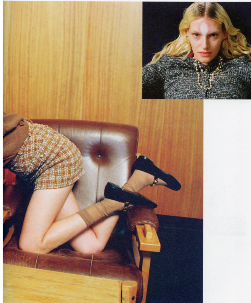
← Vesta, tvldová minisukně, boty a bižuterie, vše Chanel. Ponožky, Wolford. Hodinky Boy-Friend, náramky a prsteny Coco Crush, vše Chanel → Sako a bižuterie, oboj Chanel. Make-up: růžové pudrové oční stíny LES 4 OMBRES 88 CORAL TREASURE použité na mokro, na rtech HYDRA BEAUTY NUTRITION NOURISHING LIP CARE a rtěnka 31 Le Rouge v odstínu 1 Rouge Beige, vše Chanel