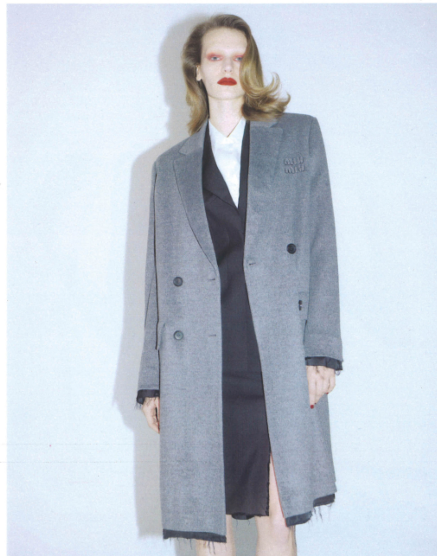
Cappotto di velour e camicia di cotone, Miu Miu. Blazer e gonna di lana, Givenchy.