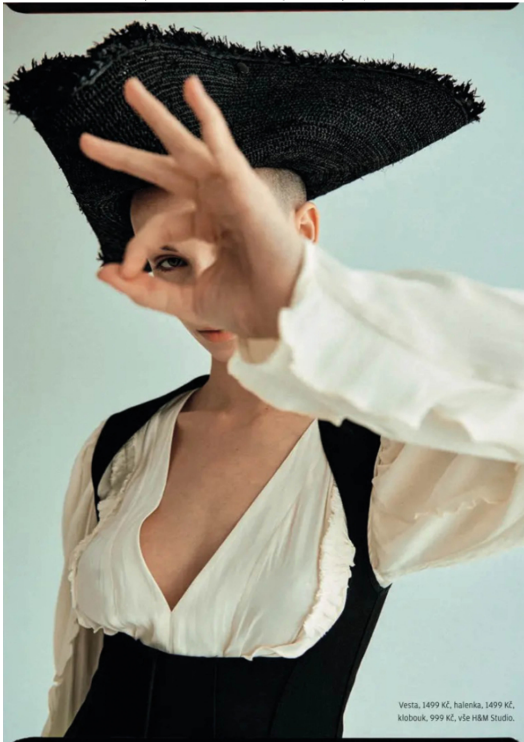
Vesta, 1499 Kč, halenka, 1499 Kč, klobouk, 999 Kč, vše H&M Studio.