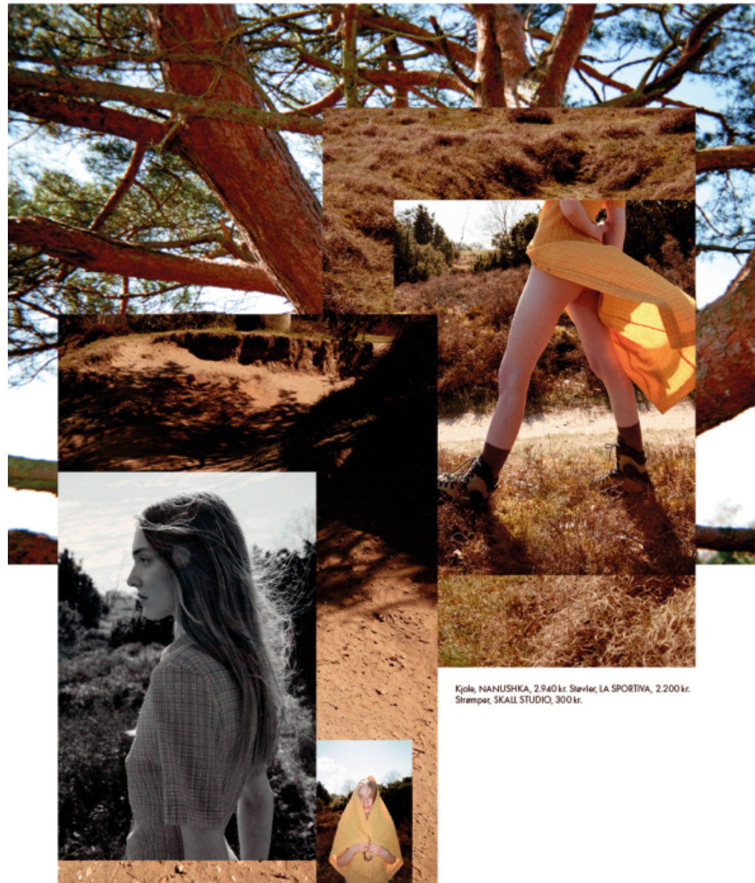
Kjole, NANUSHKA, 2.940 kr. Støvler, LA SPORTIVA, 2.200 kr. Strømper, SKALL STUDIO, 300 kr.