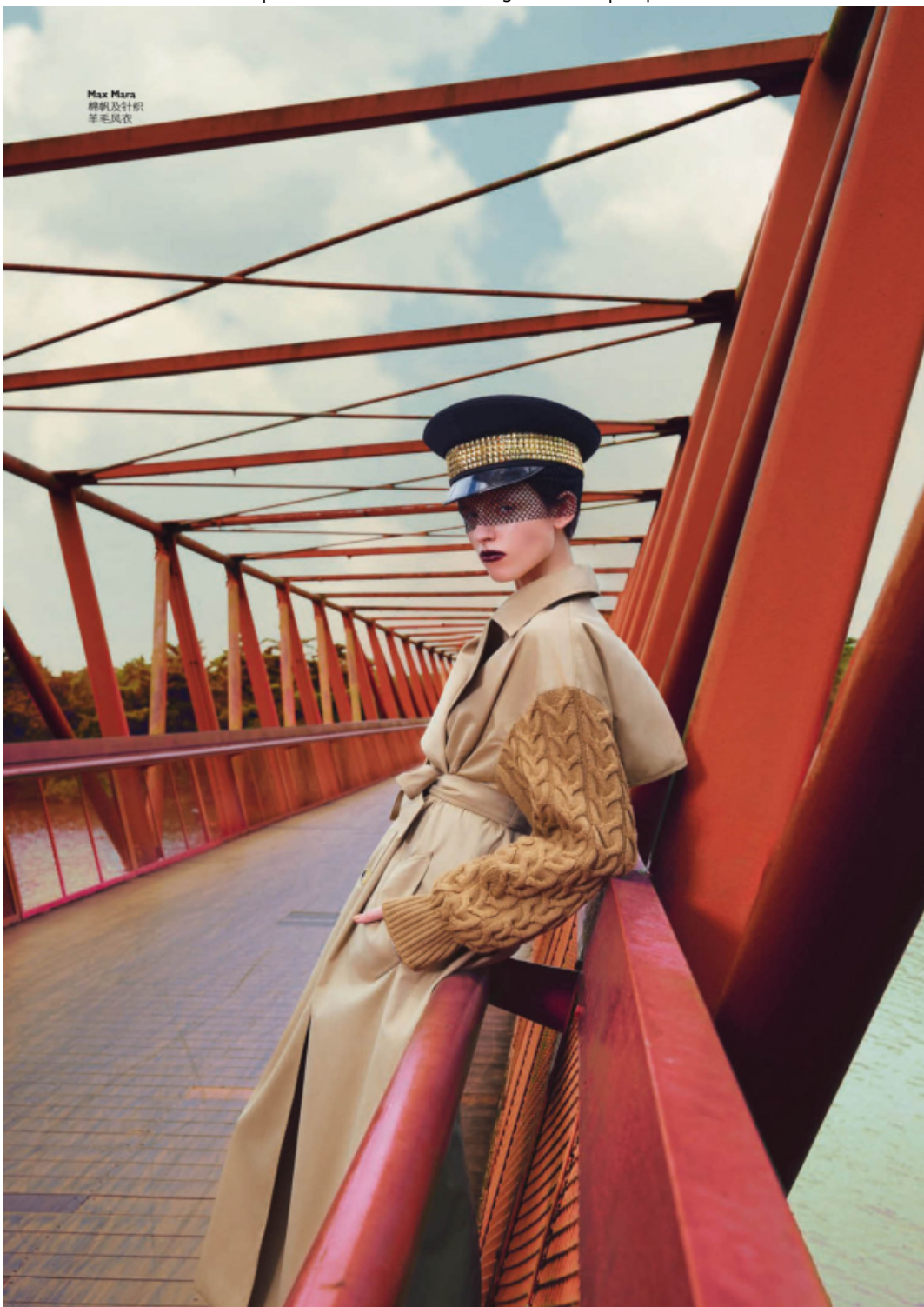
Max Mara 棉帆及针织 羊毛风衣