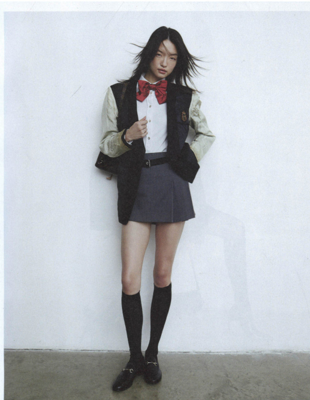
College Blazer vintage, camicia stretch in tessuto Oxford BRD · ROBERTO RICCI DESIGNS 174 euro, gonna a pieghe con cintura incorporata AMBUSH, fiocco vintage, zaino in tela Monogram LOUIS VUITTON, calze a costine CALZEDONIA, mocassini in pelle GUCCI.