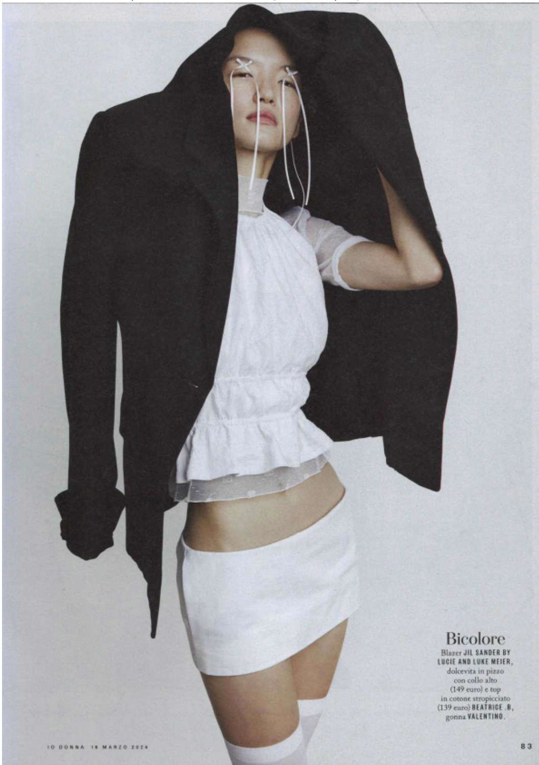
Bicolore Blazer JIL SANDER BY LUCIE AND LUKE MEIER, dolcevita in pizzo con collo alto (149 euro) e top in cotone stropicciato (139 euro) BEATRICE .B, gonna VALENTINO.