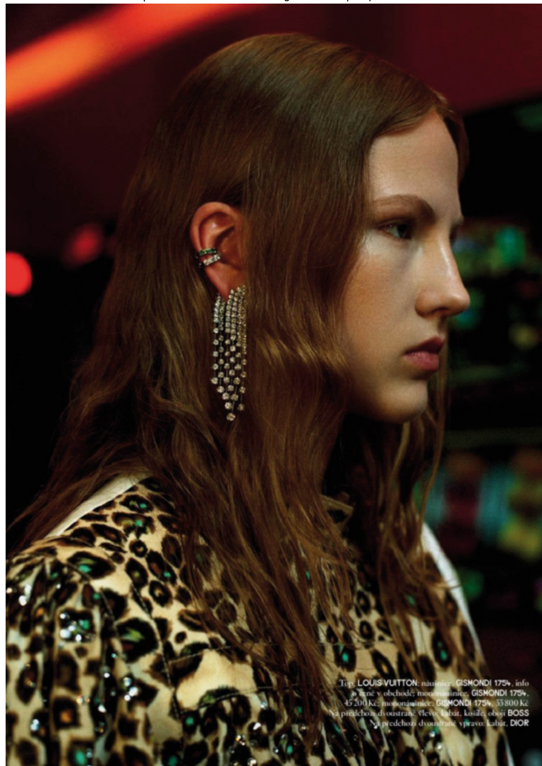
Top: LOUIS VUITTON; náušnice: GISMONDI 1754, info a kúpné v obchode; motomášanice: GISMONDI 1754, 45 200 Kč; motomášanice: GISMONDI 1754, 53 800 Kč Na predchozí dvostrané vlevo: kabát, košile, obojí BOSS Na predchozí dvostrané vpravo: kabát, DIOR