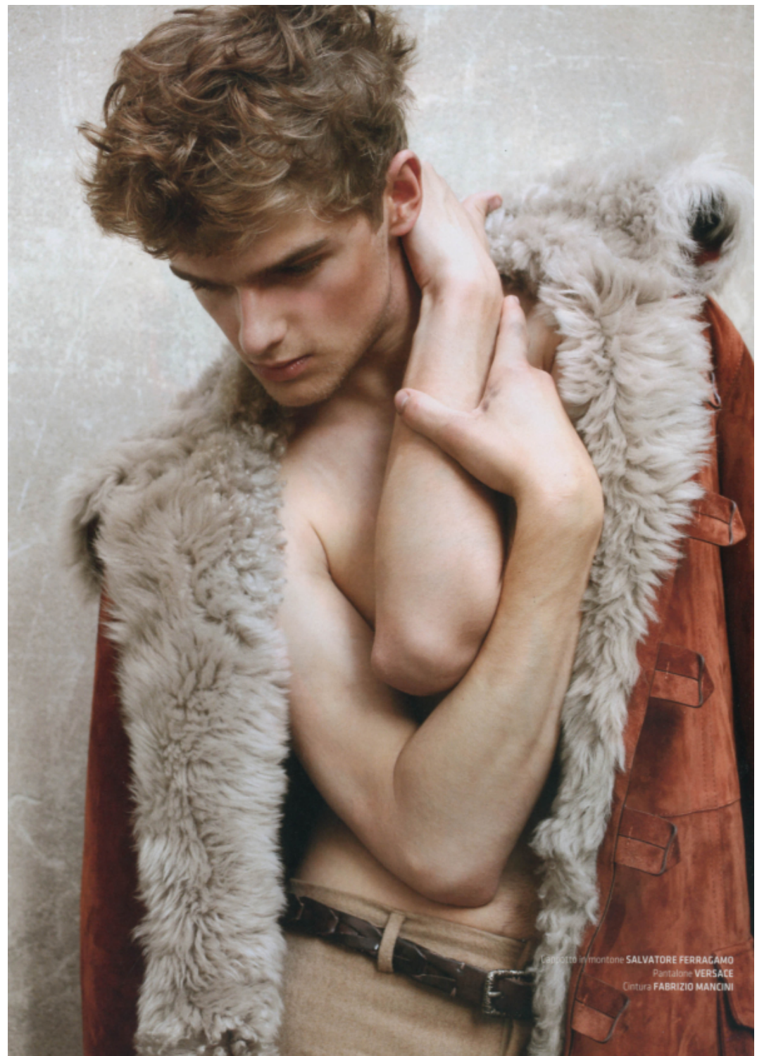
Capotto in montone SALVATORE FERRAGAMO Pantalone VERSACE Cintura FABRIZIO MANCINI