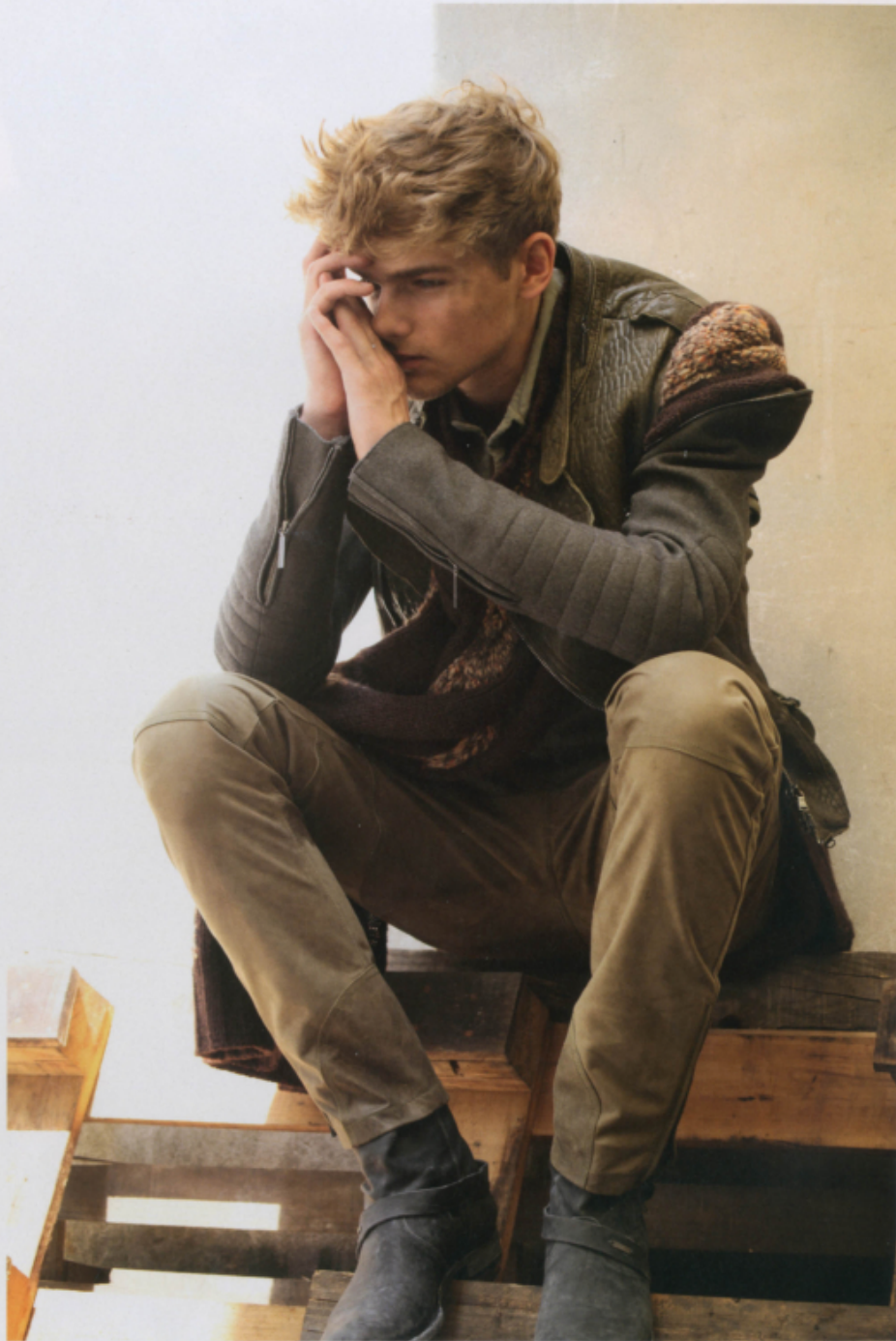
Giacca COSTUME NATIONAL / Cappa in maglia FRANKIE MORELLO / Camicia HTC / Pantalone PRINGLE OF SCOTLAND / Anfibii JOHN RICHMOND